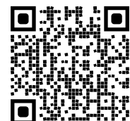
Share Buy-Back Statement